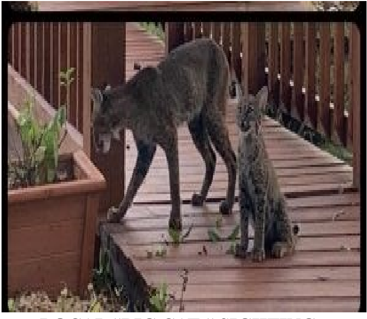
LOCAL "BIG CAT " SIGHTING

Whether or not these can be identified as Florida panthers or bobcats, these big cat sightings are a rare occurrence. Several LHE residents have been lucky enough to spot this feline and her offspring recently.