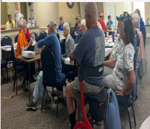
April 8th Meeting