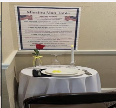
Missing Man Table in the Clubhouse