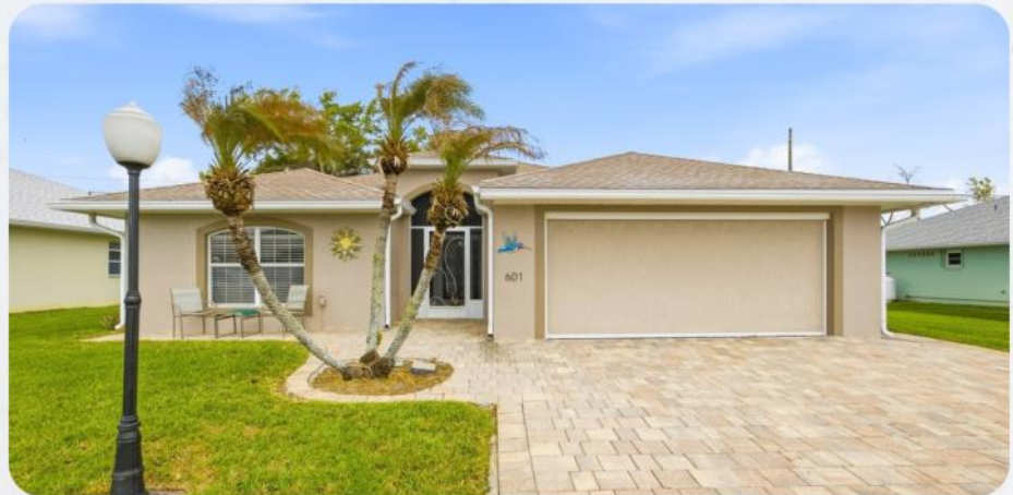
601 Sweetwater Way Haines City, FL 33844 | $339,000 3 Bedrooms | 2 Bathrooms | 1,994 Sq. Ft.