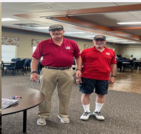
Polk County Flight of Honor Staff